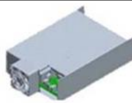
Cover with Fan