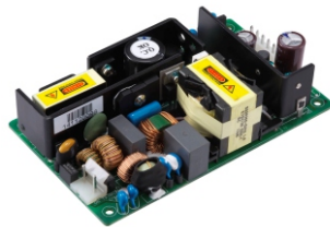
MPM-G200 series Watt: 120W/200W Input:90-264 VAC Output:+12V~14V,+19~20V...