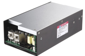
MPM-U650 series Watt: 450W/650W Input:90-264 VAC Output:+5V,+12V,+24V,+48V...