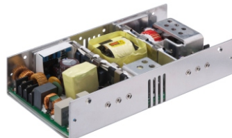
MPM-815H Watt:150W Input:90-264VAC Output:+5V,+12V,-12V...