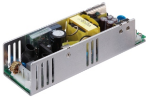
MPM-706H Watt: 60W/80W Input:90~264VAC Output:+5V,+12V,-12V,-5V...