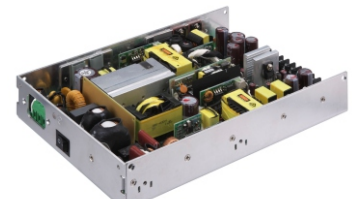
MPM-A30H Watt:300W Input:90~264VAC Output:+5V,+12V,-5V,-12V...